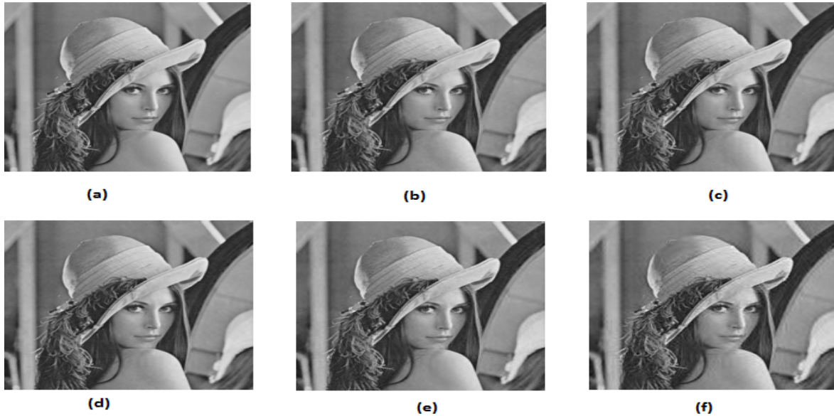
Fig.2 (a) Original Lena image compressed using by DFrFT at compression ratio(b)20% (c)40%;(d)60%;(e)80%.

Fig.2 shows the reconstructed Lena image at compression percentage of 20%, 40, 60 and 80% respectively. Even some loss occur in reconstructed image observable in PSNR value but for visual perception there is no such a difference found at 80% compression percentage also.